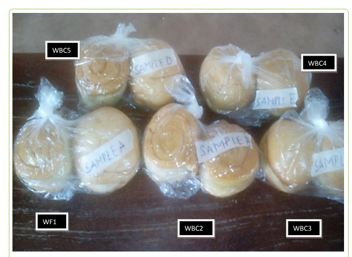
Figure 3: The pictures of the wheat, yellow root cassava, and bambara groundnut-based bread are shown in Plate 1.

Plate 1: Bread samples produced from the blends of wheat, yellow root cassava, and bambara groundnut flours.