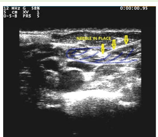
Figure 2: Needle in the space and injection procedure.