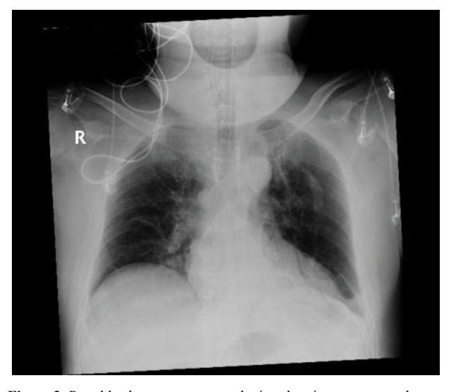
Figure 3: Portable chest x-ray pre-extubation showing no pneumothorax.

Post extubation, the patient was transferred to the PACU for close-up monitoring and pain management using intravenous morphine titration. Repeat portable chest X-ray showed no evidence of pneumothorax.