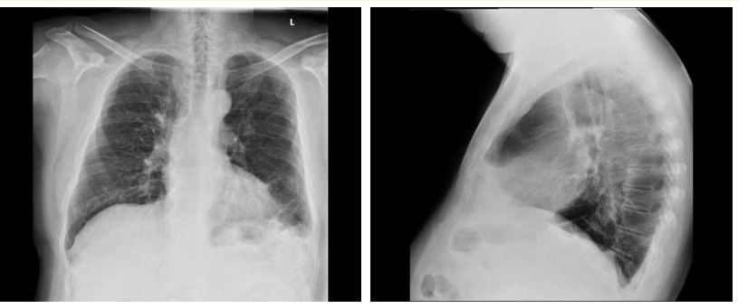
Figure 2: PA and lateral views of the chest showing left sided pleural effusion with basal atelectatic bands

Figure1: HRCT chest showing multiple bullae.