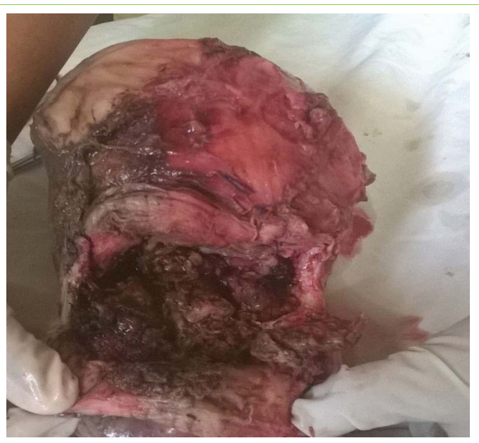
Figure 2: Adherent placental bits in lower segment.