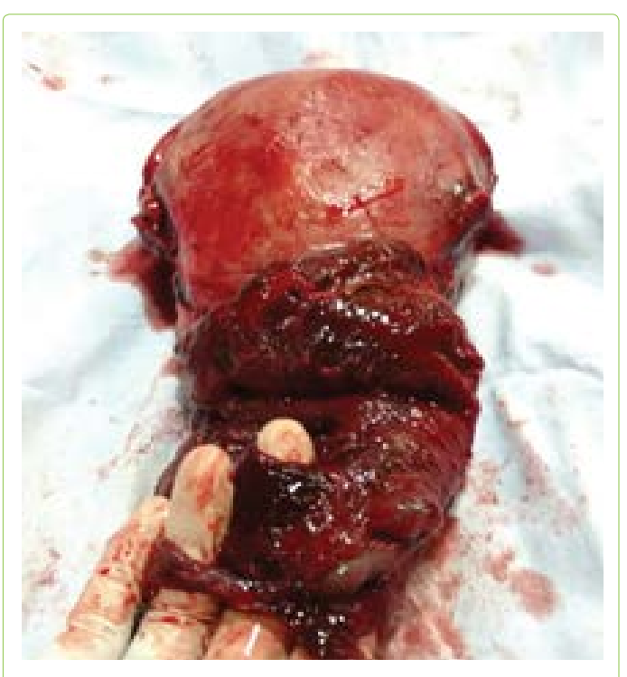
Figure 5: Anterior and posterior rupture of uterus.

hysterectomy the coming week but in view of severe bleeding she underwent emergency hysterectomy (Figure 6).