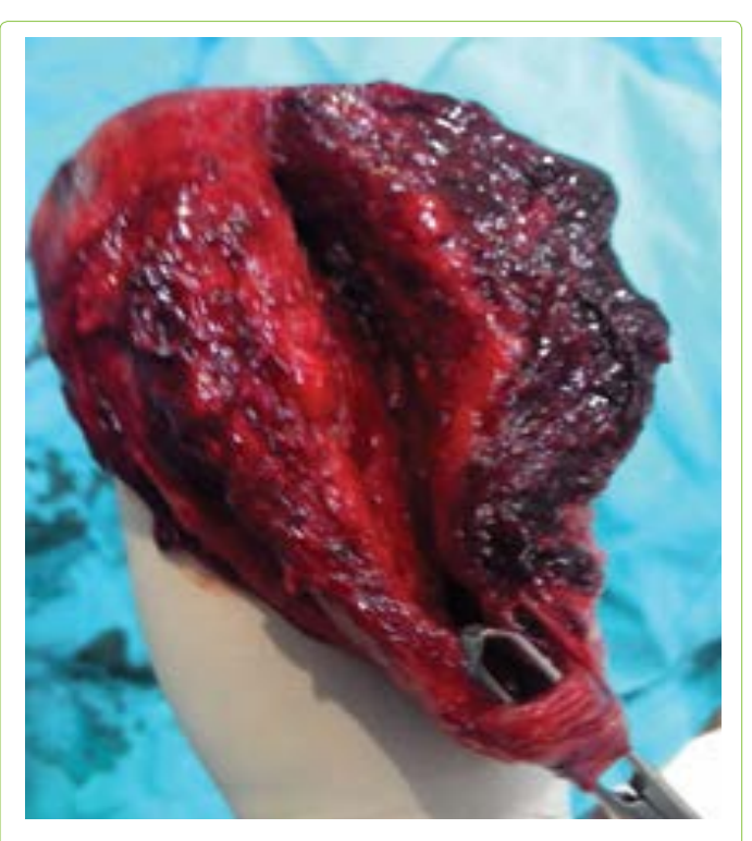
Figure 4: Uterus showing lateral wall rupture.