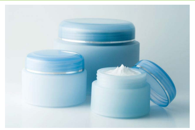
Figure 6: Skin Creams [168]. In general, creams for the skin should protect it from the sun and environmental pollutants, while also treating any specific problems. Look for the highest quality ingredients to ensure a cream's ability to live up to its claims. Enhance the circulation of blood flow by massaging creams into your skin several times a day.