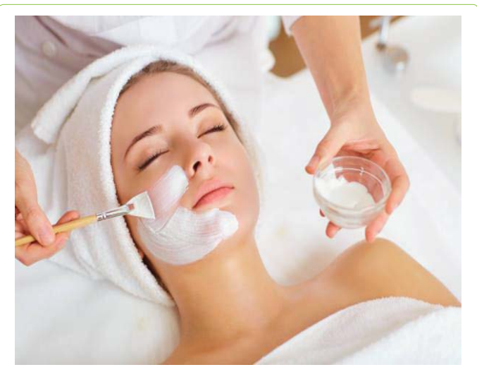
Figure 12: Facial Treatment [177-180]. Facial masks are the most prevalent cosmetic products utilized for skin rejuvenation. Facial masks are divided into four groups: (a) sheet masks; (b) peel-off masks; (c) rinse-off masks; and (d) hydrogels. Each of these has some advantages for specific skin types based on the ingredients used. Peel-off facial masks are known for their unique characteristics inherent to the use of film-forming polymers that, after complete drying, create a very cohesive plastic layer allowing for the manual removal of the product without leaving any residue. Most clay-based products on the market consist only of dried clay powder that needs to be moistened prior to use. After facial application, the product dries naturally, forming a sandy-cracked material due to the low cohesion between the dried particles. The most interesting effects of aloe vera in topical use are anti-inflammatory, antiseptic, antioxidant, and regenerative. It has been demonstrated that the association of green clay and aloe-vera exerts a beneficial synergistic effect when it comes to developing a facial mask as a regenerative aid.