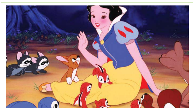
Figure 10: Disney princess, Snow White (Fairy Tale) [172,173]. In the time that Snow White was released it was a common for the majority of women desired to have blush in their faces like her. Rouge originated as a thick paste, and was made from a range of things: from strawberries, to red fruits and vegetable juices, to the powder of finely crushed ochre. As nouns the difference between blush and rouge. is that blush being an act of blushing or blush can be the collective noun for a group of boys while rouge is red or pink makeup to add color to the cheeks; blusher. Blushers, those versatile successors to rouge, help light up a complexion and accent face structure and best features.

well tolerated for immediate and long-term improvement in the appearance of mild-to-moderate hyperpigmentation and fine lines associated with photo damage when used over a 12-week period [80-85].