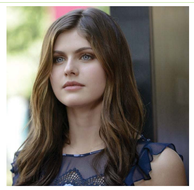
Figure 4: Beauty is in the eye of the beholder, and there is nothing better than a pair of gorgeous eyes [184]. Made from an extract of nightshade berries, also called Atropa belladonna, the resulting eyedrops dilate the pupils, providing a soft and seductive effect, just like in a romance scene of a novel where someone's eyes 'darken with desire.' In Renaissance Italy, this dusky, lustrous appearance of a lady's eyes was considered to be the height of beauty. One drop per eye would block receptors in the muscles of the eye that constrict pupil size. As one might suspect, this comes at an immediate cost to vision, resulting in blurriness and inability to focus on close objects. Though this would wear off over time, prolonged use of belladonna could cause permanent vision distortion or blindness. It also carried the side effect of increased heart rate because, let's not forget, this tincture was made of poison.

origins of the \,^{\,} symbol used to denote "woman" is that it represents the hand mirror used by the Roman goddess Venus or the Greek goddess Aphrodite. In their efforts to look beautiful, both men and women apply cosmetics to hide their flaws and accentuate their features. Cosmetics have been a part of human history as far back as the ancient Egyptians. The ancient Egyptians, Romans, and Greeks used various ingredients to soften, improve, exfoliate, and detoxify skin.