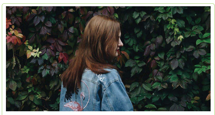
Figure 3: How Do Plant Stem Cells Help Hair Growth? [69,70]. Plant stem cells possess similar genetic factors as human stem cells and can be used to influence the function of certain cells in our skin and hair follicles. Active plant stem cells work to increase the lifespan of hair follicles so that hair can remain in the anagen phase of the hair growth cycle for a longer period of time. Another hair-growth benefit of Asparagus Stem Cells is their ability to block the most common hair-killing hormone, DHT. High levels of DHT, as well as sensitivity to the hormone, are known for causing most malepattern baldness and even female alopecia. Asparagus Stem Cells can aid the receptors in the skin to block the intrusion of DHT, and therefore minimizing the hair loss caused by it.