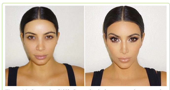
Figure 14: Contouring [182]. Contouring is the newest makeup craze that people just can't get enough of! This trend, made famous by none other than the Kardashian sisters, was created to make your face appear slimmer and more sculpted. The basic premise of it is to highlight the areas of face that someone would like to bring out, while shading in the parts she wants to make thinner.

Eye shadow is a pigmented powder/cream or substance used to accentuate the eye area, traditionally on, above, and under the eyelids. Many colors may be used at once and blended together to create different effects using a blending brush. This is conventionally applied with a range of eyeshadow brushes, though it isn't uncommon for alternative methods of application to be used such as fingers. However, it is important to have clean fingers because oils from skin can result in pimples [108,109].