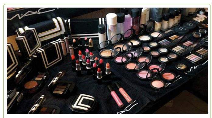
Figure 5: Modern Day Cosmetics [71,72]. Professional makeup artists have been perfecting techniques to get ordinary beauty products to multi-task for years. Cosmetics companies are now using advanced technology to develop multi-purpose products that emulate these techniques. Foundations are no longer designed to simply smooth complexions. Many now boast different ingredients to target varying skin needs, such as salicylic acid for acne or jojoba oil for dry skin. Numerous brands have also created multipurpose stains with a creamy consistency and a neutral color that can be used on cheeks, lips and eyes. Some shades of these creamy all-over-color sticks also offer a little shimmer or gold sparkle, so that it can glide across eyebrow bones, shoulders or cleavage as a highlighter -- Lauren Balukonis, beauty division at 5W Public Relations

Skin Creams be considered pharmaceutical products as even cosmetic creams are based on techniques developed by pharmacy and un-medicated creams are highly used in a variety of skin conditions in ancient times, creams were simply prepared by mixing of two or more ingredients using water as the solvent. With the advancement in technology, newer methods are used for formulation of creams. These