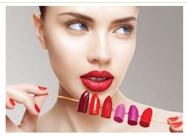
Figure 7: Lip Color [169,170], [181]. Makeup artists and advertisements for cosmetics often claim that lip color can influence facial skin's apparent lightness. Currently, we do not have scientific evidence to either support or deny these claims. The luminance contrast between facial features and facial skin is greater in women than in men, and women's use of makeup enhances this contrast. In black-and-white photographs, increased luminance contrast enhances femininity and attractiveness in women's faces, but reduces masculinity and attractiveness in men's faces. In Caucasians, much of the contrast between the lips and facial skin is in redness. Red lips have been considered attractive in women in geographically and temporally diverse cultures, possibly because they mimic vasodilation associated with eternal desire.

semisolid preparations are elegant to use by the public and society. They show versatility in their functions. Creams can be applied to any part of the body with ease. It is convenient to use cream by all the age group of people. Although it may be equally well applied to non-aqueous products such as wax-solvent based mascaras, liquid eye shadows and ointments. If an emulsion is sufficiently low viscosity to be pourable (flow under influence of gravity alone) is referred to as lotion. Creams are emulsions of oil and water. In coming future, more advanced technologies and methods will be used for preparation, formulation and evaluation of creams. Also, the demand of herbal constituents-based creams is increasing day by day [66-79].