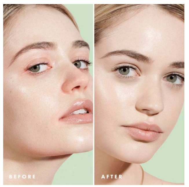
Figure 8: Comparison between before and after use of Mineral Primer [84], [171]. Photoaged skin is largely a result of chronic exposure to UV radiation. Photoaging, which causes premature aging in the appearance and function of the skin, is similar to chronological aging in that it is cumulative over time. Women frequently seek effective treatment for their irregular pigmentation as well as other clinical manifestations of photodamaged skin. The facial primer improved scores for the appearance of hyperpigmentation and other photoaging parameters immediately after the first application.

Primers are so beloved by experts because they can do so much more than just make foundation go on smoother. Primers are sort of like insurance for makeup. Although they often wear many hats-smoothing, concealing, protecting and prepping-their main roles are to keep makeup on longer and give skin a smooth, flawless finish. This creates another layer between skin to prevent acne and makeup clogging up pores. Primer creates an even tone throughout the skin and makes makeup last longer. Primer is applied throughout the face including eyes, lips, and lashes. This product has a creamy texture and applies smoothly. Many makeup primers are formulated with silicone-based polymers, like dimethicone, because of their ultra-smoothing effects. Photo aged skin results from various environmental factors, most importantly chronic sun exposure. Dyschromia and fine lines/wrinkles are common clinical manifestations of photo damaged skin. The facial primer was shown to be effective and