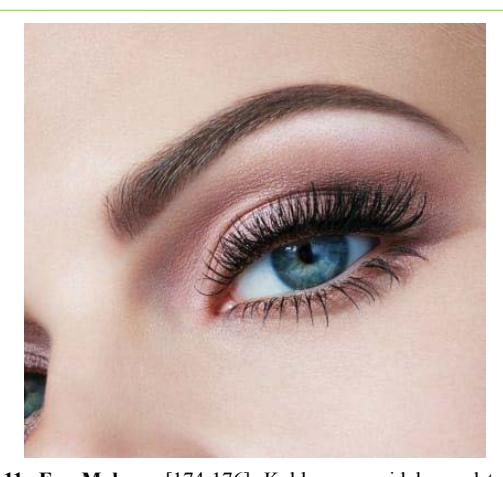
Figure 11: Eye Makeup [174-176]. Kohl was a widely used traditional cosmetic. It may be a pervasive source of lead poisoning in those areas and among individuals from those areas who have immigrated to developed nations. Despite the fact that cosmetic products undergo rigorous testing to ensure they are safe for human use; some users report mild discomfort following their application. The cutaneous changes, such as allergic dermatitis, are well reported, but the ocular changes associated with eye cosmetic use are less so. Some pigmented cosmetic products may accumulate within the lacrimal system and conjunctivae over many years of use, but immediate reports of eye discomfort after application are most common. Changes to the tear film and its stability may occur shortly after application, and contact lens wearers can also be affected by lens spoliation from cosmetic products. Additionally, creams used in the prevention of skin aging are often applied around the eyes, and retinoids present in these formulations can have negative effects on meibomian gland function and may be a contributing factor to dry eye disease.

Face powder sets the foundation and under eye concealer, giving it a matte finish while also concealing small flaws or blemishes. It can also be used to bake the foundation, so that it stays on longer and create a matte finish. Tinted face powders may be worn alone as a light foundation so that the full face does not look as caked-up as it could. Loose powder comes in a jar, has smaller particles (and therefore a finer