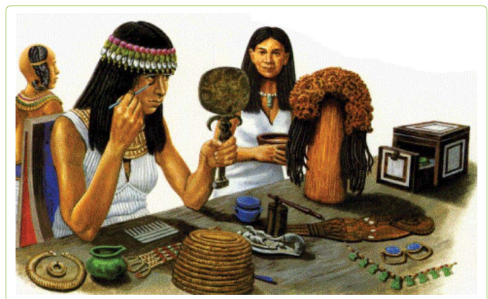
Figure 1: The Beauty of Yesterday: Ancient Egypt [183]. Often referred to as the vainest civilization in history, Ancient Egyptians are known to have played a vital role in shaping modern ideals of beauty. For example, these populations used olive oil, honey and milk to keep their skin wrinkle free, as well as the pigment from clay to create lip and cheek tints to recreate a healthy glow. Another prime example is their use of a charcoal-like substance called Kohl to create thick black lines around their eyes to enhance their natural shape, believing that by following this technique, it would also protect their eyes from the glare of the sun.

and teeth). We use cosmetics to cleanse, perfume, protect and change the appearance of our bodies or to alter its odour's. Products that claim to 'modify a bodily process or prevent, diagnose, cure or alleviate any disease, ailment or defect' are called therapeutics. Whatever the process one wishes to take, there is one goal in mind: covering up imperfections (Figure 1,2). Most cosmetic products are complex mixtures of chemical compounds that are directly applied to the skin. Unlike pharmaceutical products, cosmetics are not intended to cure diseases. However, modern cosmetics are often "functional". Products for whitening, wrinkle care, moisturizing, and treating pores, spots, etc. are produced to meet the needs of today's consumers. Thus, some cosmetic products contain quasi-drugs, although their effects on the body remain mild and gentle. Because cosmetics are freely used by consumers with no daily-exposure limits, the absorption of quasi-drugs (and other ingredients) through the skin needs to be carefully controlled, which makes