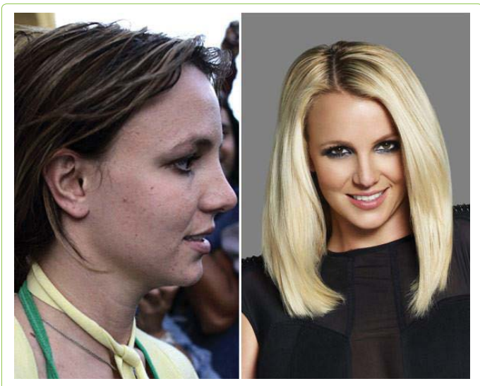
Figure 9: Pimpled and no pimpled Britney Spears [185,186]. At glamorous, Hollywood events, the ".... baby one more time" star Britney Spears' skin seems flawless, but in reality, this is far from the truth: redness, pimples, rashes – the singer knows all of these problems too well, first hand. However, Girls and women often use concealer or foundation to cover up their pimples. This makes them feel more comfortable in public. Young men sometimes use subtle foundation, powder and concealer as well.