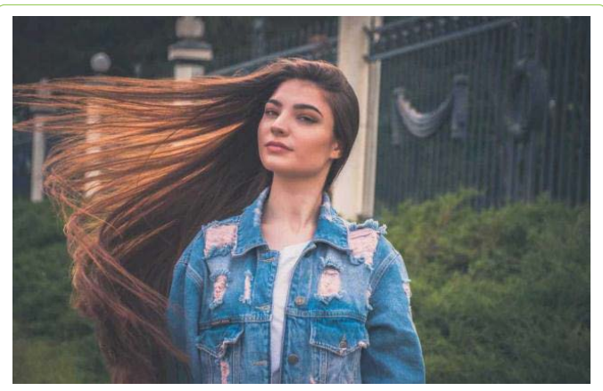
Figure 13: Woman with long beautiful hair [187,188]. The main purpose of shampoo is to remove dirt and oil from the surface of the hair fibers and the scalp, while the main purpose of conditioner is to ensure that the hair is smooth for combing. Shampoos typically contain a primary and a secondary surfactant for thorough cleaning, a viscosity builder, a solvent, conditioning agents, pH adjuster and other non-essential components such as fragrance and color for commercial appeal. Conditioners usually contain silicone polymers to increase shine and soften hair, cationic polymers such as quaternary nitrogen compounds to reduce static electricity, bridging agents to increase absorption, viscosity builder, pH adjuster and components for commercial appeal.

consistency), and usually gives lightweight coverage. It's also messy and hard to transport, so this guy is meant to stay at home. The difference between setting powder and finishing powder is a little nebulous. Many companies use these terms interchangeably, so it's partially a matter of marketing [6-8], [95-97].