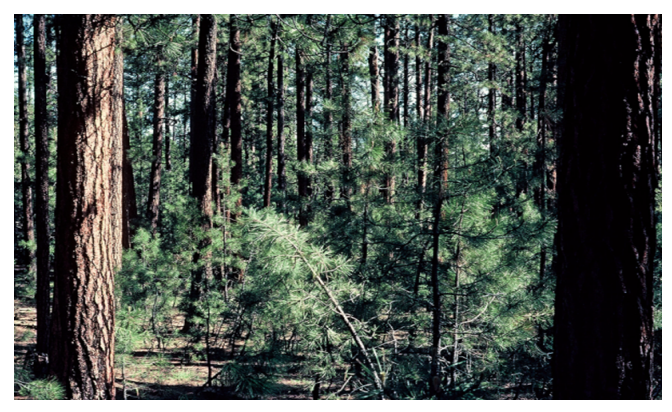
Figure 1B: Conditions in an overstocked ponderosa pine stand on Castle Creek in the Apache-Sitgreaves National Forest.

pine forests and determined that associated environmental degradation must be corrected. There was concern that past fire exclusion had increased the likelihood of high severity wildfires that would impact the City of Flagstaff and adjacent communities. An increased potential for insect and disease outbreaks was another concern. They initiated an effort to improve forest health by working together.