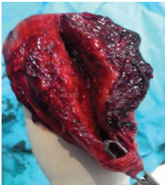
Figure 4: Uterus showing lateral wall rupture.