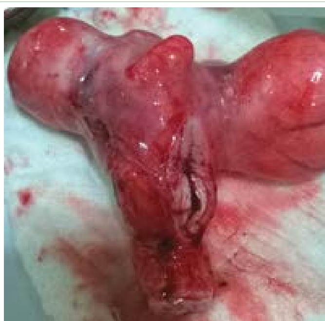
Figure 6: Uterus with multiple fibroids.

Uterine atony was the commonest indication for EPH in past followed by uterine rupture. Our study too indicated uterine atony as the commonest indication for EPH as reported by many other studies [1,3-5]. Postpartum