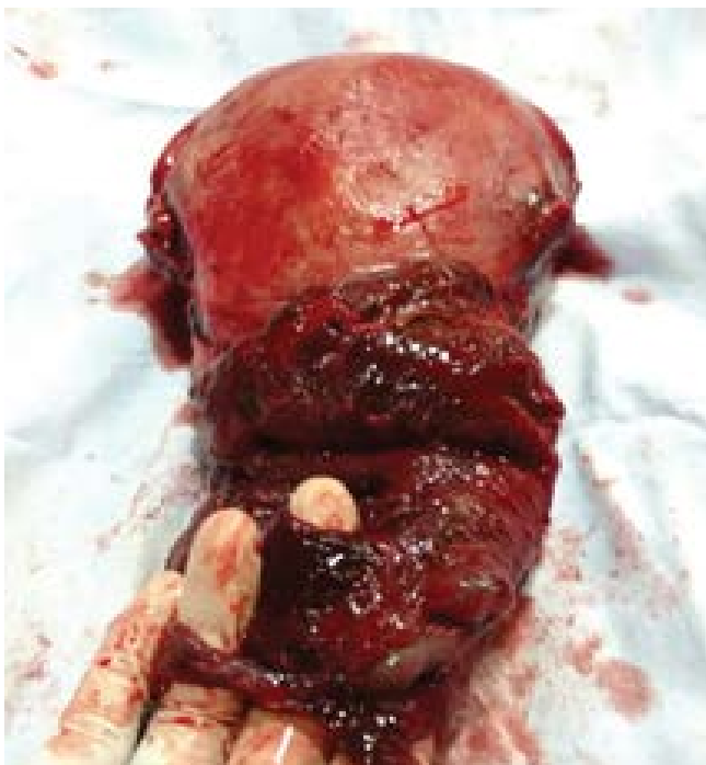
Figure 5: Anterior and posterior rupture of uterus.

hysterectomy the coming week but in view of severe bleeding she underwent emergency hysterectomy (Figure 6).