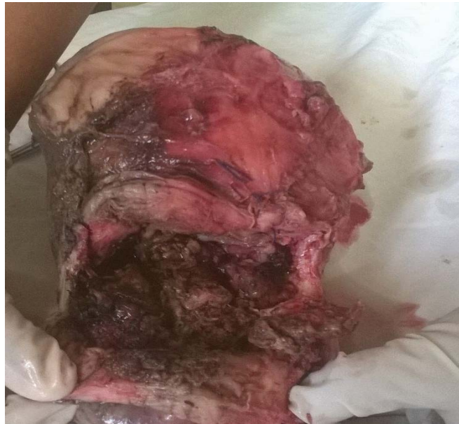
Figure 2: Adherent placental bits in lower segment.