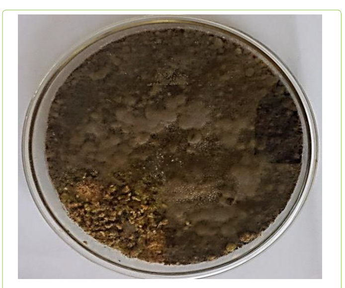
Figure 2a: Alternaria species growth on sugarcane bagasse medium (incubation period: 14days).

The capacity of sugarcane bagasse to support the growth of Alternaria and Microsporum species as demonstrated on Figure 2a and 2c attest to the fact that the constituents of the bagasse can supply adequate amounts of nutrients essential for their growth. The ability of these fungal species to grow and produce measurable amounts of biomass at the expense of sugarcane bagasse on the other hand, indicates that these fungi species possess the requisite enzymes enabling them to utilize the available carbon, nitrogen, sulphur and phosphorous for cellular growth [22]. Although, both fungal species actively grew and produced measurable biomass on sugarcane bagasse medium, Alternaria species was found