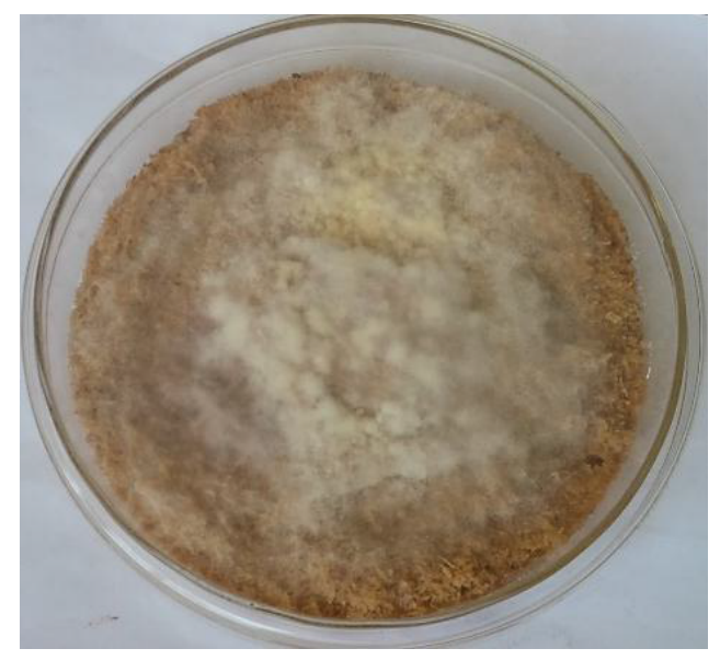
Figure 2c: Microsporum species growth on sugarcane bagasse medium (incubation period: 14days).

to exhibit faster and more luxuriant growth compared to Microsporum species. Also, higher proportion of the bagasse was found to have been lost following the growth of Alternaria species (9%) as compared to 5.7% recorded following the growth of Microsporum species over the same period of incubation. This observation could be attributed to several factors that may include the slow ability of Microsporum species to hydrolyze carbohydrate polymers (hemicellulose, cellulose and lignin) found in sugarcane bagasse [23-25].