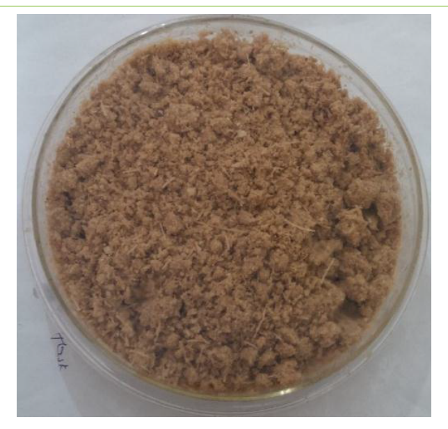
Figure 2b: Un-inoculated sugarcane bagasse medium.

Table 2: Percentage of sugarcane bagasse to growth of Alternaria and Microsporum species over 14 days' period.