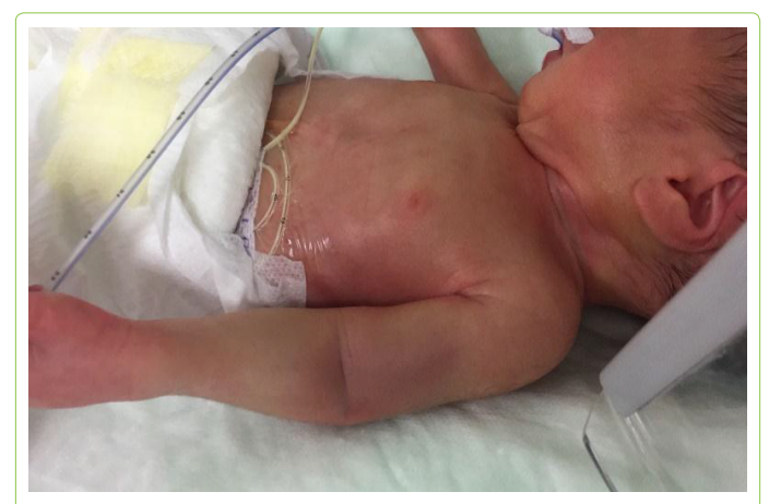
Figure 1: General view of distal humeral epiphyseal seperation of right side of premeture patient.

to the distal humerus (Figure 2) Normal relationship of the proximal radius and ulna was apparently maintained. There was no evidence of bone fractures in the distal metaphyseal region of the humerus or in the proximal radius and ulna (Figure 2). The patient was initially diagnosed clinically as having a dislocation of the elbow. But distal humeral epiphyseal separation was diagnosed via ultrasound (Figure 3). Because of extreme prematurity and low weight, it was decided not to attempt an open reduction. On day 5 after caesarian section delivery, closed reduction was attempted; this was successful. Consequently, a full cast in 110° of flexion of the elbow and pronation of the forearm was applied until the sonography revealed periosteal reaction and new callus formation over the distal humeral metaphysis at around 2 weeks. There are no neurological problems, before and after reduction maneuvers, were seen. At discharge (76 days of life), passive or active restriction of range of motion at the elbow wasn't present. Four months after injury, new X-rays were done and observed good remodeling changes over the distal humeral metaphysis, which corresponded with the previous sonographic findings (Figure 2 and 3). The articular relationship was normal, for both flexo-extension of elbow and prono-supination of forearm were evaluated normal.