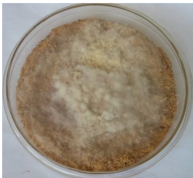
Figure 2c: Microsporium species growth on sugarcane bagasse medium (incubation period: 14days).

to exhibit faster and more luxuriant growth compared to Microsporium species. Also, higher proportion of the bagasse was found to have been lost following the growth of Alternaria species (9%) as compared to 5.7% recorded following the growth of Microsporium species over the same period of incubation. This observation could be attributed to several factors that may include the slow ability of Microsporium species to hydrolyze carbohydrate polymers (hemicellulose, cellulose and lignin) found in sugarcane bagasse [23-25].