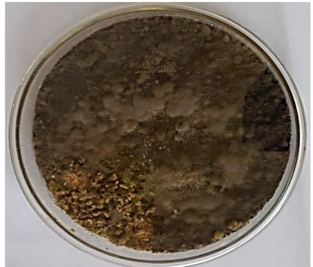
Figure 2a: Alternaria species growth on sugarcane bagasse medium (incubation period: 14days).

The capacity of sugarcane bagasse to support the growth of Alternaria and Microsporium species as demonstrated on Figure 2a and 2c attest to the fact that the constituents of the bagasse can supply adequate amounts of nutrients essential for their growth. The ability of these fungal species to grow and produce measurable amounts of biomass at the expense of sugarcane bagasse on the other hand, indicates that these fungi species possess the requisite enzymes enabling them to utilize the available carbon, nitrogen, sulphur and phosphorous for cellular growth [22]. Although, both fungal species actively grew and produced measurable biomass on sugarcane bagasse medium, Alternaria species was found