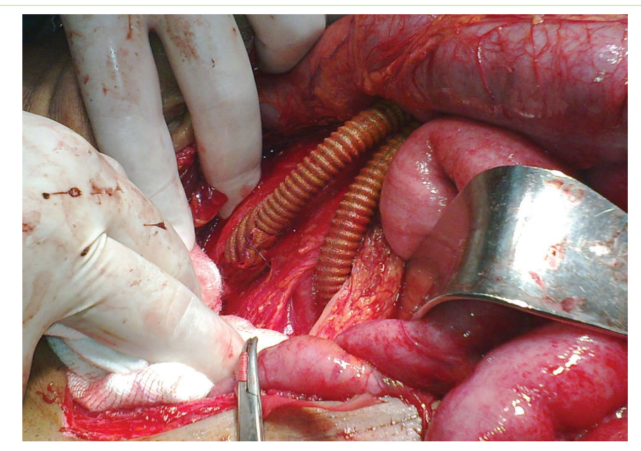
Figure 4: Prosthetic reinforcement and wrapping of the distal right aortofemoral anastomosis with a patch of a synthetic heparin-bonded Dacron<sup>®</sup> graft in cases of aortobifemoral bypass surgery.