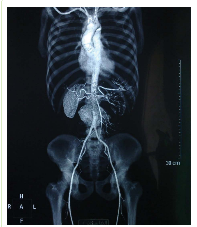
Figure 1: CTA showing infrarenal abdominal aortic aneurysm.

The used graft for aneurysm repair was heparinbonded Dacron® graft, which is made of polyethylene terephthalate (PET) (Dacron<sup>®</sup>) - heparin-impregnated Dacron<sup>®</sup> graft [InterGard heparin-bonded Dacron<sup>®</sup> grafts (MAQUET Holding GmbH & Co. KG., Rastatt, Germany)]. We used Y-shaped graft, the size of which ranged from (16mm×8mm) to (18mm×9mm) and only one tube graft and its size was (20mm) in diameter. The open surgical technique was performed through a transperitoneal approach. The infrarenal abdominal aorta was exposed showing the aneurysm sac (Figure 2), followed by exposure of the iliac arteries. Two separate longitudinal incisions were performed at both groins centered at the mid-femoral point to expose the common femoral artery on both sides for distal graft anastomoses. Systemic heparinization was given in a dosage of (75-100 U/kg) and the aortic neck proximal to the aneurysm sac was clamped followed by clamping of the iliac arteries. The aneurysm sac was opened longitudinally and end-to-end vascular anastomosis was performed at the aorta distal to the origin of the renal arteries using a