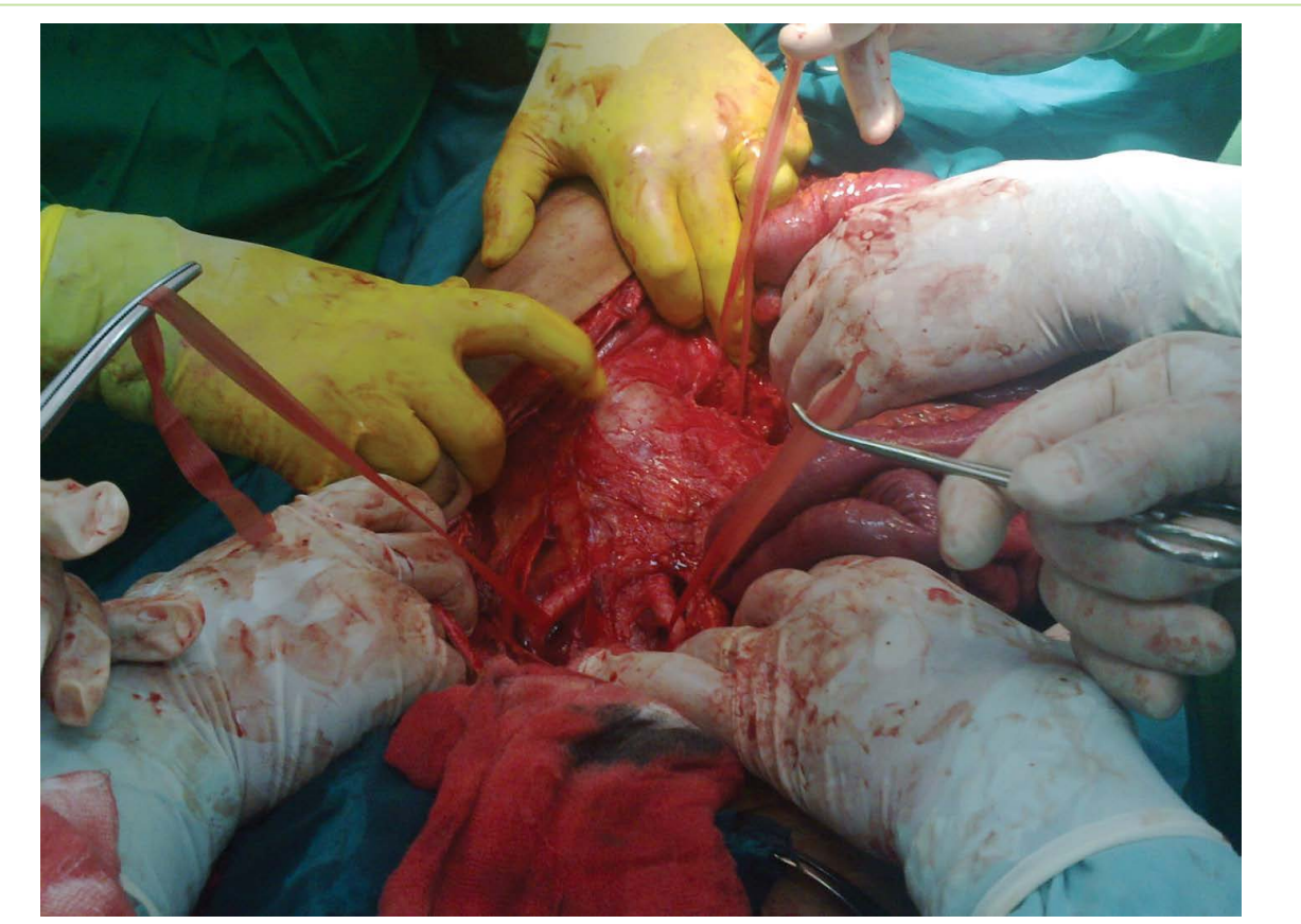
Figure 2: Transperitoneal operative exposure of an infrarenal abdominal aortic aneurysm.