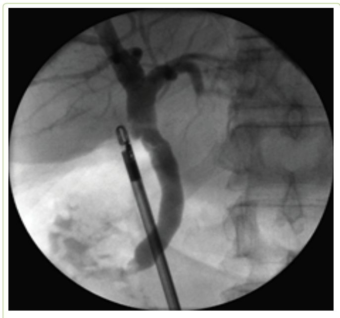
Figure 3: Cholangiogram attained from IOC during SILC.

All of our 18 patients successfully underwent IOC during SILC (100% success rate). All IOC were completed via a single umbilical incision, and no additional ports or percutaneous needle placement were required. No patients reported any intraoperative complications. Of the 18 patients who underwent IOC during SILC, 15 patients' IOC (83.3%) were