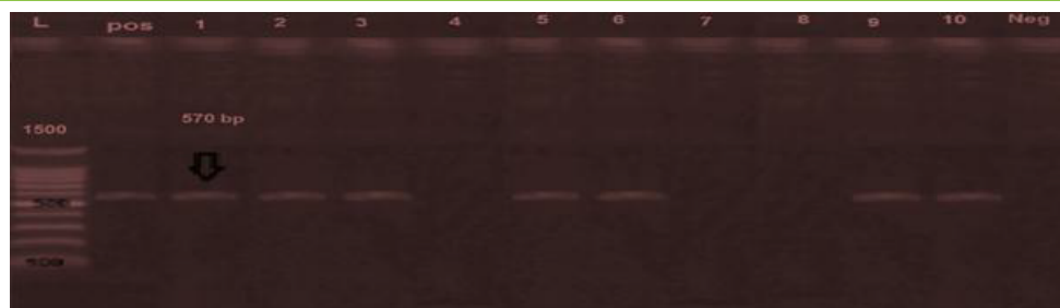
Figure 2: Showed Agarose gel electrophoresis showing positive amplification of the product 570bp fragment of Coa gene of S. aureus performed with specific primer. L: 100–1500bp DNA ladder; Pos: positive control of S. aureus ; lanes 1-10: 1, 2, 3, 5, 6, 9 & 10 +ve results of S. aureus ; lane 4, 7 and 8 –ve result; Neg: negative control.

The hematological findings of naturally infected broiler chicks in this study are reported in the table 6. The hematological parameters revealed a significant decrease in RBCs count, Hb concentration and PCV in the diseased birds indicated anemia as compared with the control group. Also, a significant increase in total leucocytic counts, lymphocyte and monocyte in diseased groups as compared with control groups. In the levofloxacin treated group, significant increases of RBCs, Hb concentration and PCV levels were